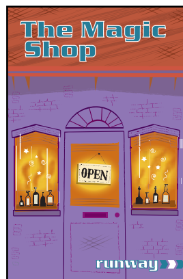
Sample pages taken from Runway: The Magic Shop