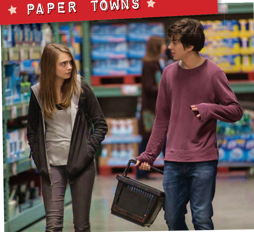
Actors Cara Delevigne and Nat Wolff in the film of Paper Towns.

It can take years for a book to be turned into a film. The mystery novel Paper Towns , a story about a teenager's quest to find his missing friend, hit bookstores in 2008. The film version opened in cinemas seven years later.