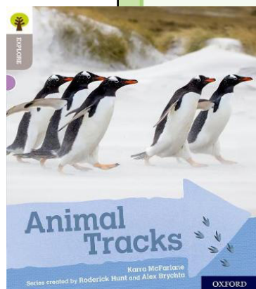
Sample pages taken from Animal Tracks Book Band Level Lilac