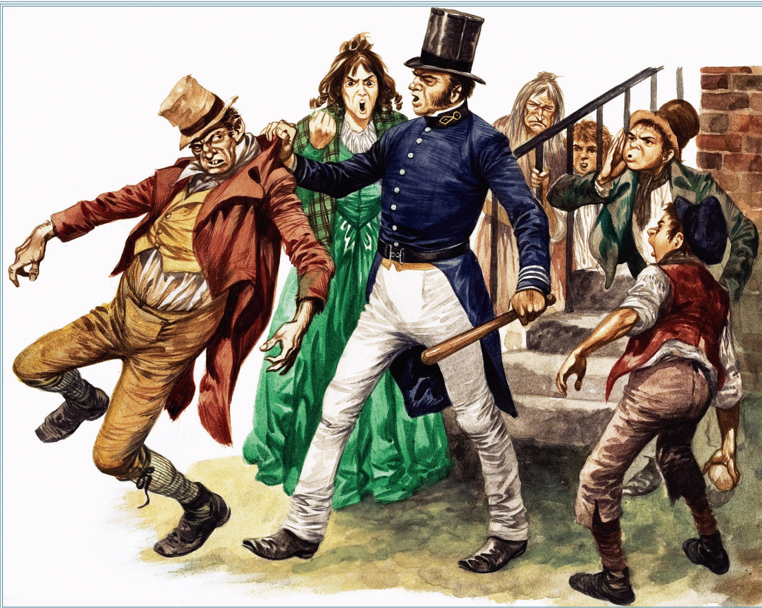
Peeler catching a criminal

By the 1820s, the crime rate in London was very high. Sir Robert Peel led changes that removed watchmen and formed a paid, uniformed police force. They became known as 'peelers'.