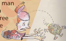
Brain on the Loose

The brain can survive for a few seconds without the body. After a man was guillotined in 1905, a doctor called his name three times. And three times the eyes opened and looked at the doctor.