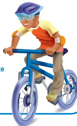
a mountain bike