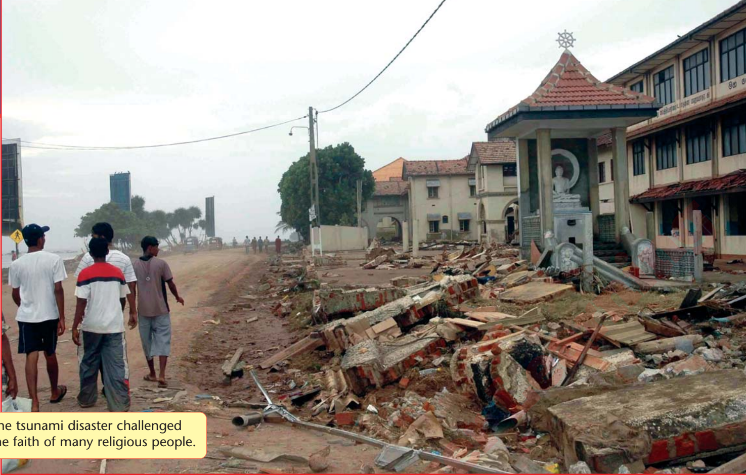
The tsunami disaster challenged the faith of many religious people.