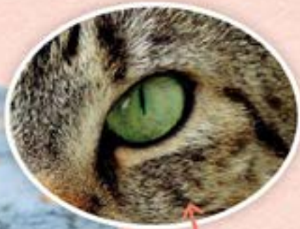
The eye of a cat.